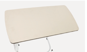
Table top is made of phenolic resin laminate with PVC cover.