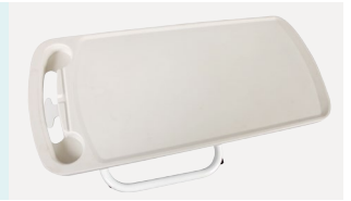
Table top is made of HDPE, easy clean, high quality environmental material, light weight, corrosion resistance, impact resistance, easy to clean and disinfect, durable for use. With groove to put cups and pen.