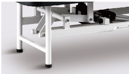
1.2-1.5 mm Thickness powder coated steel frame, 250 kg bear loading