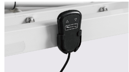
Hand controller, keep qualified after 2000 times use