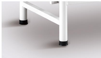
4 pcs Anti-slip bed feet covers