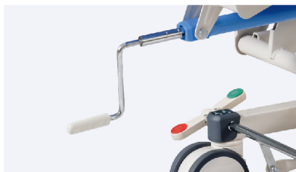
Stainless steel handle with plastic handle, more durable and beautiful