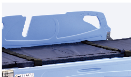
Water proof mattress with 2 belts