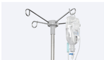
Full SS IV pole, bearing 15kg