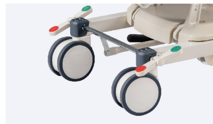
6 inch controlled castors