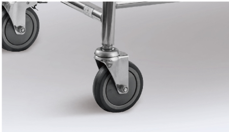
5silence caster. Advanced protection universal brake wheel, easy to move, simple to operate, reliable performance