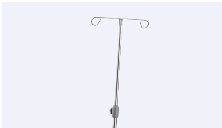
Adjustable stainless steel I.V pole, outside diameter \Phi 19*1, inside diameter \Phi 16*1, telescoping scope 750mm, load capacity: 15KG