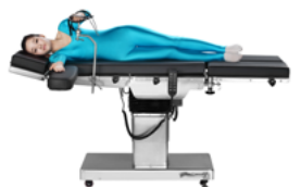
(Optional) Lateral Arm Support