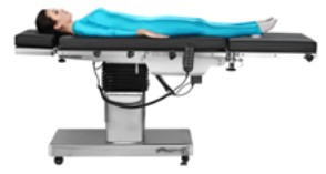
Longitudinal Adjustment 0-300mm