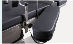
Leg Support with Cushion