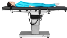
Highest Position of Table Top 1000mm