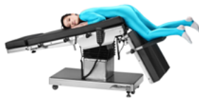
Anorectum Operation Position