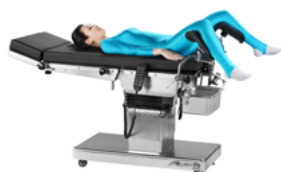
(Optional) Waste Basin For Gynecology