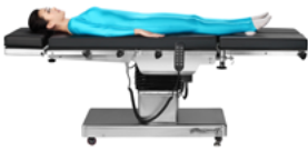
Lowest Position of Table Top 700mm