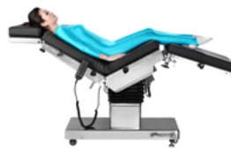
E.N.T Operation Position