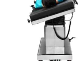
Lateral Tilt Left 0°-20°