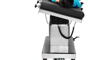
Lateral Tilt Right 0°-20°