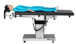
(Optional) Head Rest