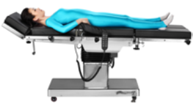
Kidney Bridge Elevation 110mm