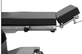
Head Plate Up 0°-45°