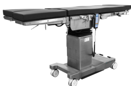
Highest Position of Table Top 1010mm