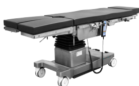
Horizontal Sliding 350mm