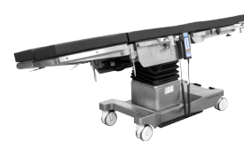
Lateral Tilt Right 0°-15°