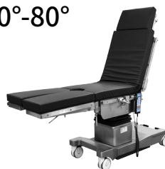
Back Plate Up 0°-80°