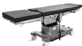
Lowest Position of Table Top 710mm