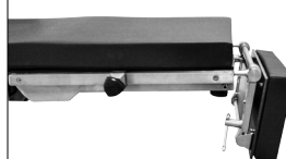
Head Plate Down 0°-90°