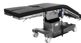
Back Plate Down 0°-20°