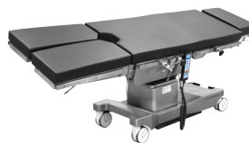
Lateral Tilt Left 0°-15°